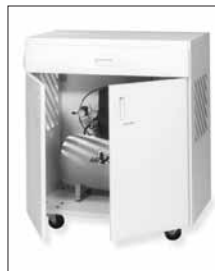
OPTIONAL PORTABLE ACCU-SEALER CART (SHOWN W/INDUSTRIAL COMPRESSOR)