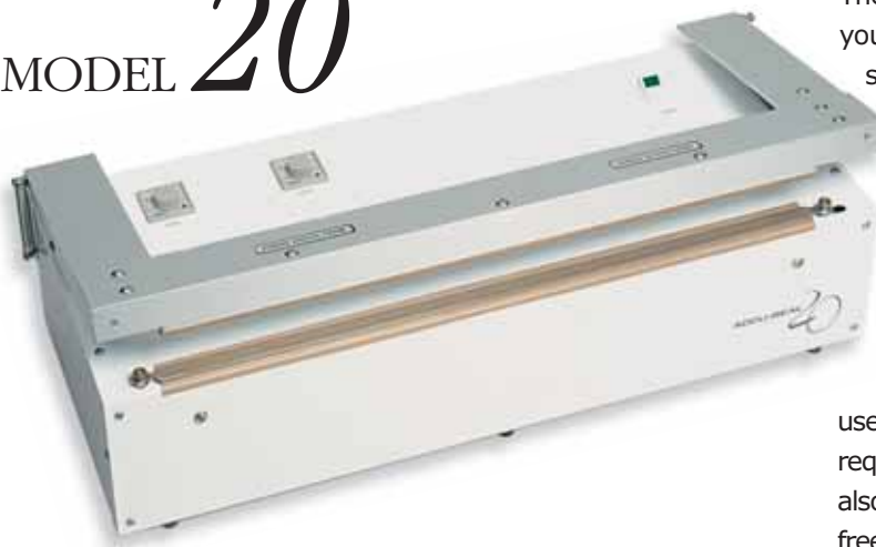
Manual Impulse Sealer