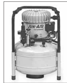
OPTIONAL ULTRA-QUIET LAB/OFFICE COMPRESSOR