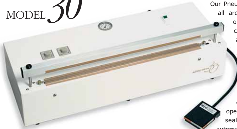
Pneumatic Impulse Sealer